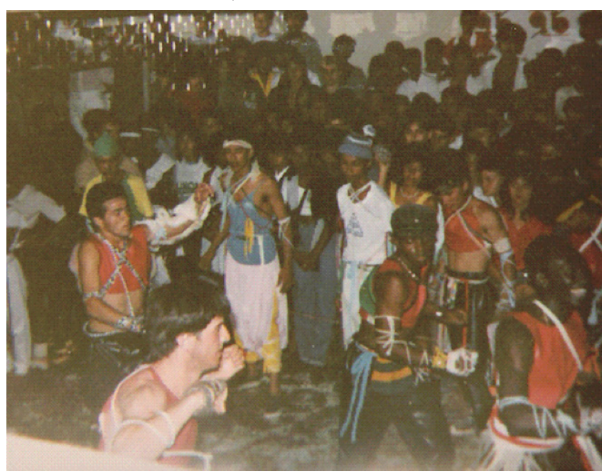
Image 1 Presentation of the Turma Jazz de Rua (Jazz Street Gang) inside the Pedal Nightclub in 1987.

Despite the noticeable participation of the mass media, and the reproductive aspect of dance steps during the 1980s, the dancers residing on the peripheries of Uberlândia did not have systematic training, thus information was appropriated and performed by the popular sectors<sup>5</sup> of the city. These aspects gave rise to a plurality of ways of rearranging information from funk, modern jazz dance, and from the dances originating in hip hop. That is how street dance came to be, through what Michel de Certeau (1998) called "cunning", which is related to unauthorized ways of action<sup>6</sup>. Therefore, street dance is characterized by no need to replicate the past or fundamentals. Rather, its specificity resides in the aesthetic possibilities of remaking dances.