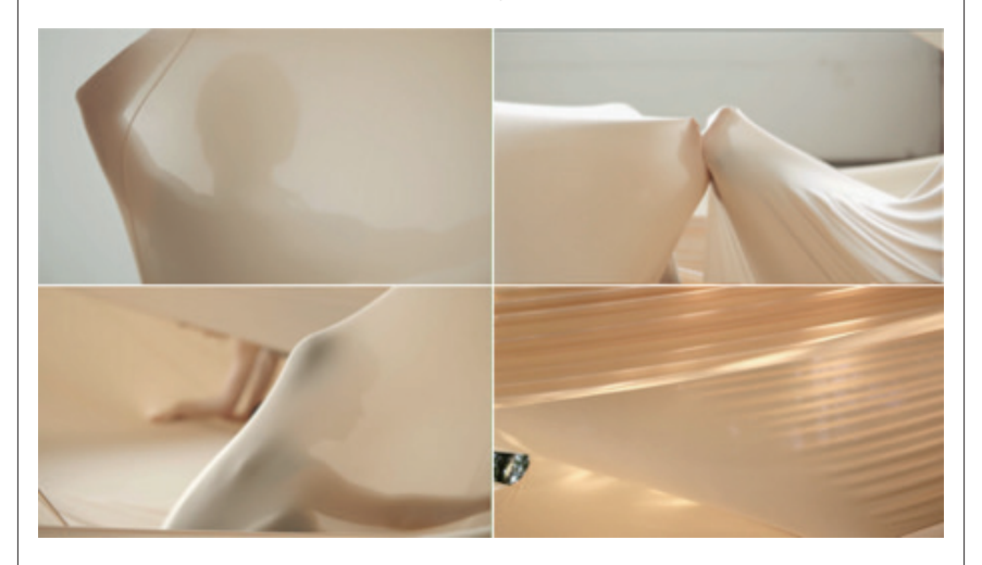
FIGURE 3 The installation INSIDE/OUTSIDE exhibited at Järnhallen, Gothenburg, spring 2018. Video documentation of the installation, Järnhallen at https://youtu.be/P-1KW7wYpOA

Kent's reflections support Dean's (2011, p. 180) description of somatic costumes, which can be used to bridge the inner somatic experiences of performers and outer forms perceived by an audience and support the creation of the expression of the piece. Kent's experience invited us to explore how materials can be used to create internal experiences and awareness for an audience by transforming the audience into participants engaging with the material choreography.