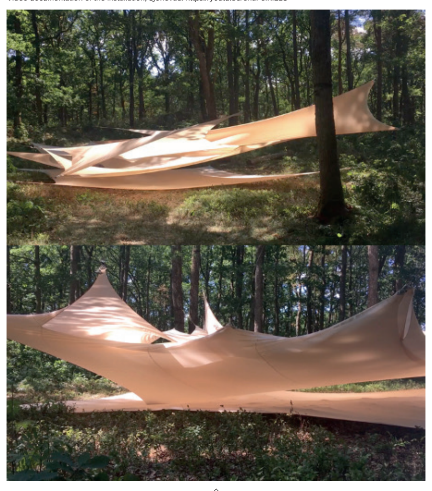
FIGURE 5 The installation exhibited at WuArt Space, Sjönevad Festival, Summer 2018. Video documentation of the installation, Sjönevad: https://youtu.be/enaPelRiELU

and the exterior environment, allowing them to experience inner stillness. The two hours of discussions that followed each workshop gave the participants the opportunity to share their thoughts and experiences. Although these sessions were optional, all the participants stayed. During the discussions, all of the workshop participants described having had positive experiences; some felt that they had new tools for self-care, and the majority experienced a reduction in tension and pain in their bodies – a sensation of being in their bodies, of being present and relaxed, while simultaneously energized, in a somewhat mindful state Francisco J. Varela et al. (1991, p. 25) note that, when in a mindful state, we are often reminded of how "disconnected humans normally are from their very experience"; similarly, in many of the discussions the participants expressed that presence and mindfulness are lacking in their everyday lives, as are spaces such as the one in question, which highlighted the stressful nature of society from a critical material and verbal perspective.