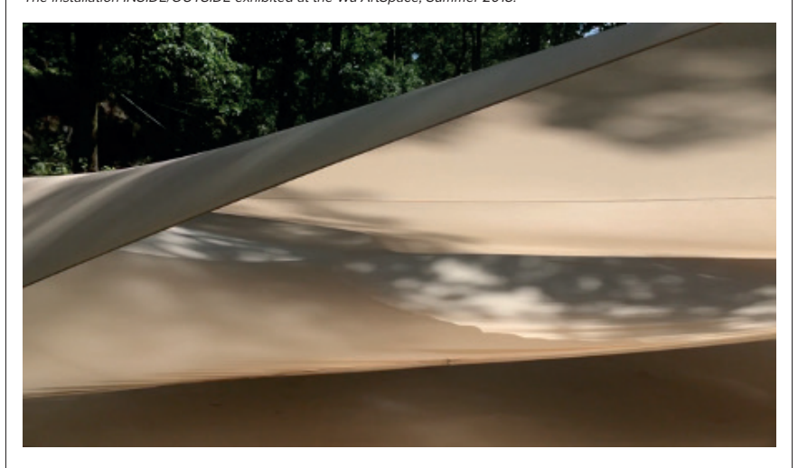
Figure 1 The installation INSIDE/OLITSIDE exhibited at the Wu ArtSpace, Summer 2018.