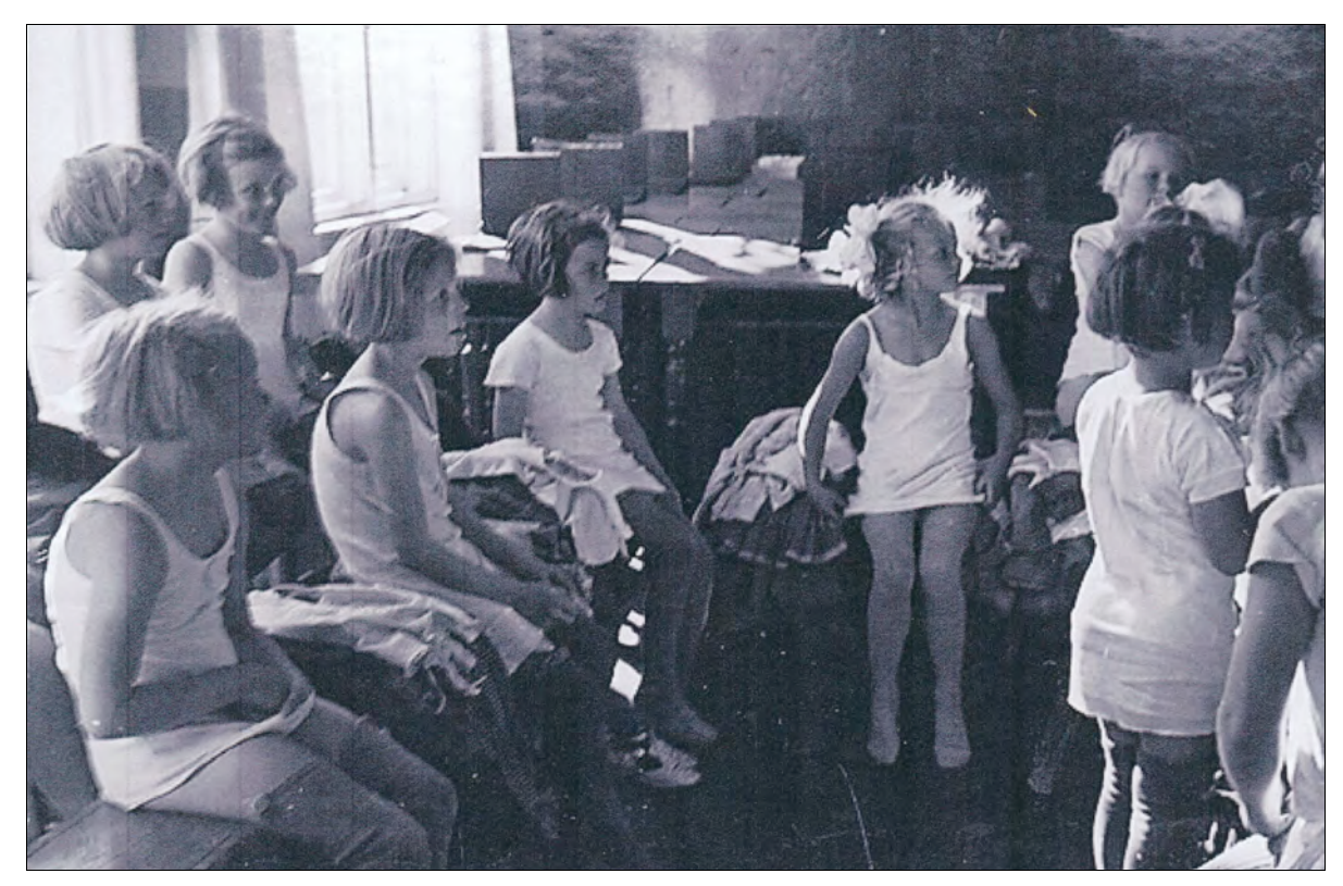
Figure 2. Especially in the combat of infectious diseases and for the detection of nutritional disturbances health surveys had a high standing and were a very important medical tool in the first half of the twentieth century. Here, children at the Sofienberg primary school in Oslo are waiting to be examined by the school nurse ca. 1933. (Unknown photographer. Oslo city archive A-0041/Ua/0002/135.)

(8), taking into account the recent and rapid achievements in microbiology. Medical science developed rapidly in these years. The historical and geographical approach to the understanding of diseases swiftly gained in interest. The books by Hirsch inspired other researchers also in other countries to follow suit.