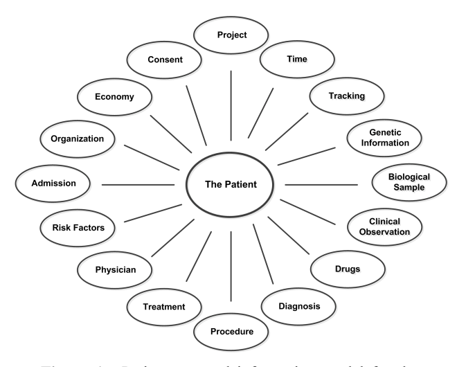
Figure 1. Patient-centered information model for the data warehouse.

The model will also facilitate data exchange between the different organizations, i.e. between population cohort biobanks and hospitals, thereby fulfilling one of