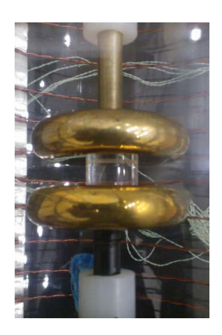
Fig. 1: PMMA test object between the plane parallel electrodes.

The electrode arrangement can be seen in fig. 1.