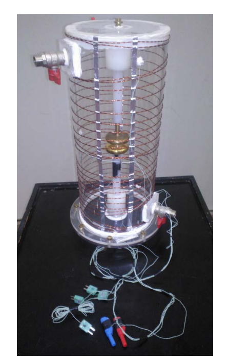
Fig. 2: Temperature and moisture controlled chamber, housing test object and electrodes. Clearly can be seen the heating wires wrapped around the chamber and the inlet and outlet for the cold gas.

The electrode arrangement was placed in a hermetically sealed 14 litre acrylic chamber, the water content of which was observed using a hygrometer. Cooling was provided by means of controlled heat exchange with an outer chamber held constantly at a temperature of -25°C. A heating element wrapped around the outer surface of the chamber ensured controlled heating conditions. The chamber can be seen in fig.2.