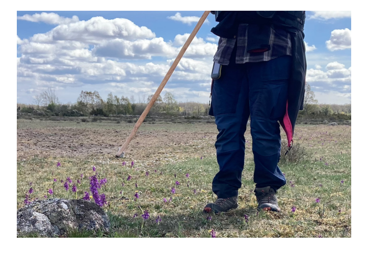
Figure 2. The excursion leader points with a walking stick towards an orchid, directing the participants' attention. Other equipment includes a Dictaphone (top), a GPS tracker (on the waist) and a wearable loudspeaker system

Aiding the group guidance, the excursion leader was in possession of several other tools that helped shape the practices, as is visible in Figure 2. To ensure that all participants could hear the description of the flora and the milieu, the leader wore a vest with patched-on loudspeakers, amplifying the statements uttered through a headset. This, in turn, provided a way to sonically follow the events of the tour even if a participant lingered and was not at all times physically located in direct proximity to the leader or the site currently under scrutiny. Species documentation was primarily conducted through a Dictaphone, recording the species mentioned by the leader and the questions coming from the association members. Another device used was a GPS tracker, tracing the path that the leader took throughout the site. Both the Dictaphone and the GPS tracker were analytically understood as inscription devices (cf. Latour & Woolgar, 1986; Law, 2004); the Dictaphone recorded speech to digital audio files and the GPS tracker converted the trail from non-trace-like to trace-like form. Altogether, these tools shaped the temporal and spatial aspects of the identified species through digital stamps in the recorded sound file and through geographic positions in the GPS tracker, respectively.