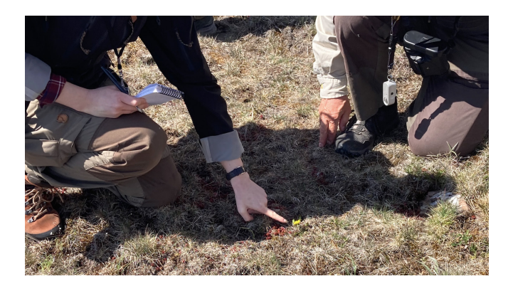
Figure 1. Two participants are kneeling on the ground, trying to identify a dandelion

During the time of identification, the species started to take the shape of epistemic objects in the sense that they opened up for questions, fostering further inquiry (cf. Knorr Cetina, 2001). A prominent example of this was the effort to identify dandelions, of which there are more than 900 microspecies in the Nordic countries. Being able to describe and identify a dandelion by eyesight was, hence, no easy task, but the utilisation of a magnifying loupe enabled this practice to a greater degree. In Figure 1, both the loupe and the notebook are visible as tools used by the participants for trying to make sense of the flower in question, establishing an epistemic object. The leaves, the buds and the details provided indicators that can be recognised either by field guides or via the experience-based knowledge shared between participants.