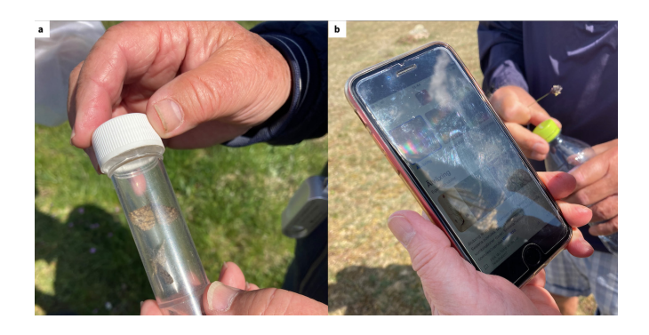
Figure 3. (a) Two at the time unidentified insects sampled in a tube from a sweeping net and (b) a strain of Sesleria uliginosa identified through the image recognition application Google Lens

Another tool used for sampling findings at the excursion, albeit in a slightly different form, was that of the image recognition-supported smartphone application Google Lens, integrated into the official Google search app. Through such an app, primarily used by two participants in the excursion, it was possible to identify species on the fly with the aid of deep learning technology. As seen in Figure 3b, two participants identified a strain of Sesleria uliginosa using the smartphone application. The identification was not unproblematic as it depended on human-nature alignment. The participants described how hands shivering when holding the strain of grass made it difficult for the application to parse the image seen through the camera. Likewise, the wind blowing on the little strain made it flutter, and the need for good lighting was considered crucial for the image recognition to be correctly conducted. Apparently, the application mistook an O. mascula for a Muscari botryoides, implying another instance of classificatory negotiations. Through continual use, the epistemic objects emerged in relation to the image recognition app.