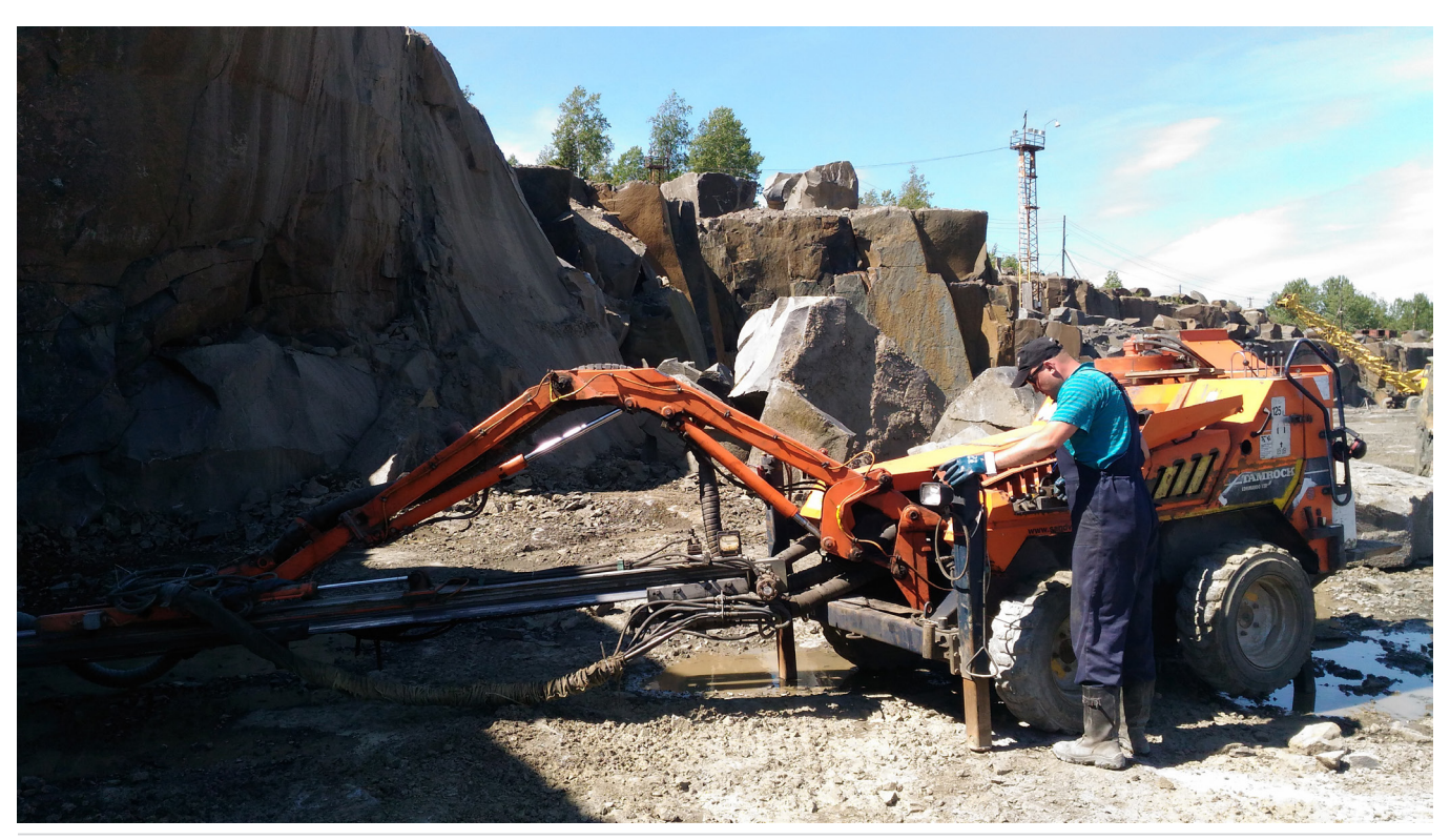
Fig. 2. Mining worker at a diabase quarry in Rybreka.

the production of glass. After the fall of the Soviet Union, due to financial difficulties of the 1990s, state mining enterprises were partly closed, partly sold to private owners. The quartzite extraction near Shoksha almost stopped (it is managed by a small-scale private enterprise with approximately twenty workers). Diabase extraction is maintained by several private companies of different sizes, mostly located near Rybreka village. Throughout the Soviet time and in the post-Soviet period, the mining quarries of diabase and quartzite remained the primary employment sources in Veps villages (see Fig. 2).