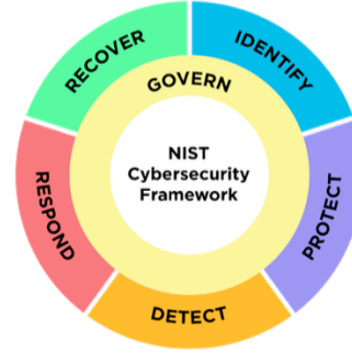
(b) Cyber Functions Wheel, by [23]