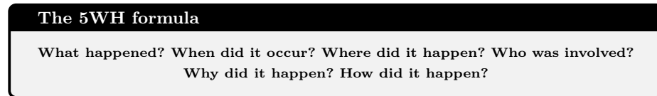
Fig. 2: The 5WH formula, outlining key questions for analysis, from Årnes [1]

The term investigation refers to a methodical and comprehensive process of collecting, analyzing, and assessing information, evidence, and facts to uncover and comprehend the details surrounding a specific event, situation, or circumstance. This can be achieved by seeking answers to the 5WH questions [1,2,15], shown in Fig 2 below.