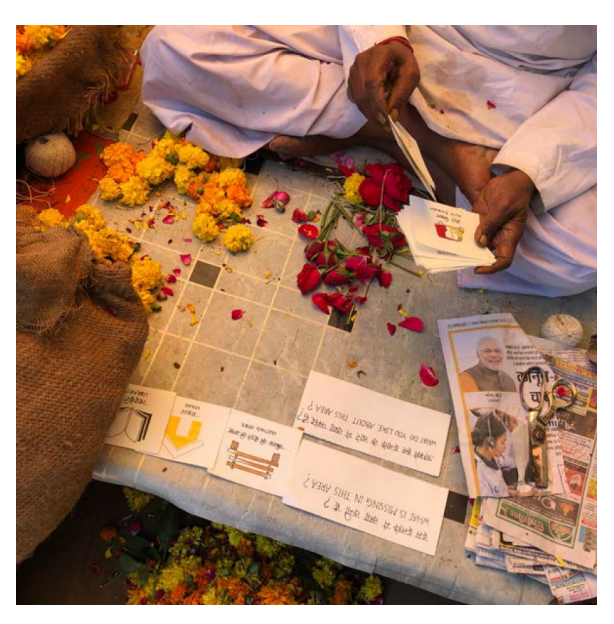
Figure 1: A citizen using icon cards to answer questions in a semi-structured interview.

allowed the students to translate their observations into recognizable icons. The process of simplifying ideas and concepts into icons helped them to (re)structure and prioritize their thoughts and observations about the area, helping them to build new links and challenge their previous understanding. Testing the cards allowed both for testing of assumptions, of cultural appropriateness of icons while at the same time leaving flexibility for the creation of new icons. The use of these cards was indicated as a good conversation starter and base for storytelling. Indeed, the relatable icons allowed for a quick and less threatening engagement, where the participants felt they were in control. Moreover, the repeated use of the same cards and icons in different individual stories with each its specific links and connections, allows students to build rich and meaningful knowledge structure, which is a requisite for deep and future learning [8].