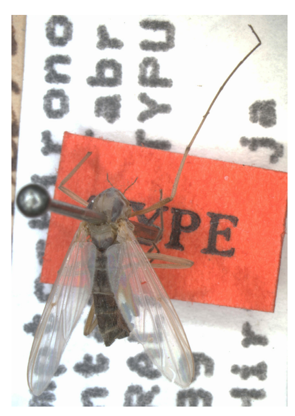
Figure 2. Chironomus tentans Fabricius; paralectotype, dorsal view.

As in the case of Tipula monilis , positive species identification of the Linnean specimens of T. plumo-sa would require microscopic evaluation of at least partial slide mounts. However, the special permission that would have to be obtained for such analysis is not the only obstacle here, as shall be discussed in the following text sections.