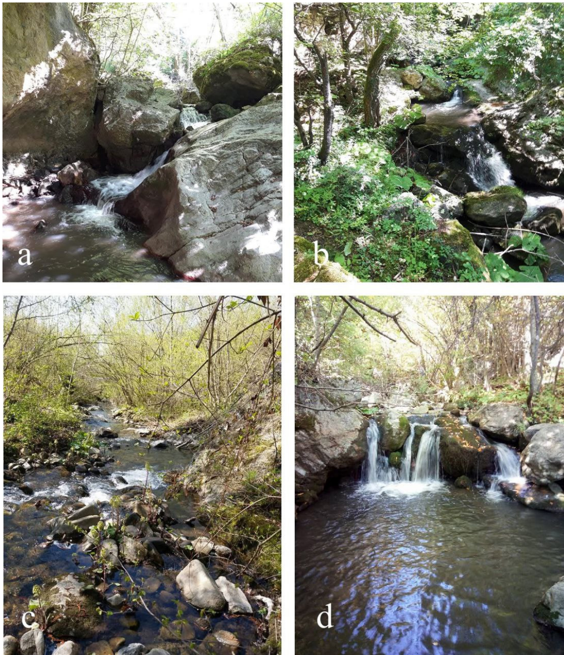
Figure 2. Sampling habitats at Lepenc River Watershed, Kosovo (a-d). a-b. Dimcë, c-d. Dërmjak.

The sampling was carried out at two sampling sites: Dimcë (Figs 2a-b) (42.170295°N, 21.315259°E) and Dërmjak (Figs 2b-c) (42.173038°N, 21.316659°E) in Hani i Elezit Municipality, Kosovo. Both sites are located within Kosovo's Lepenc River Watershed and the Black Sea Basin. At the Dimcë sampling site, the stream bed was primarily composed of large rocks, accompanied by stones, pebbles, gravel, and a small amount of fine sediment. The streambanks were densely vegetated, with over 80% of their surface covered