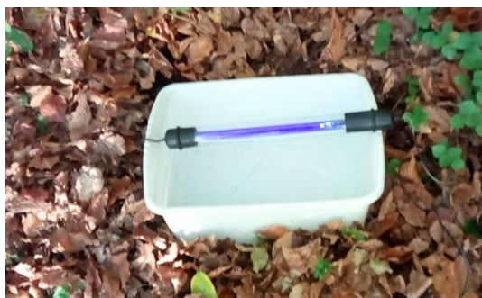
Figure 1. The ultraviolet light trap used for the collection of Chironomid specimens.

The adult Chironomidae specimens were sampled at night with ultraviolet pan traps. The 50 cm-diameter pan traps were filled approximately 30% with a solution of 30% water mixed with a few drops of detergent and positioned near the water source. To attract specimens, ultraviolet light sources with an eight-watt output were installed above the white pans and operated from dusk to the next morning (Fig. 1). Collected samples were immediately preserved in 80% ethanol. The adult specimens were