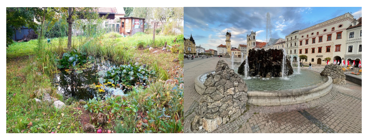
Figure 1. View of the urban pond (left) and city fountain (right) in Banská Bystrica, where Parachironomus mono-chromus exuviae were collected.

Chironomid pupal exuviae (CPET, Wilson and Ruse 2005) were collected from the water surface using a circular net (mesh size 0.5 mm) from the end of April to the end of October in weekly (pond) or biweekly (fountain) intervals. Larvae collected accidentally in the drift samples were also processed in the study. The