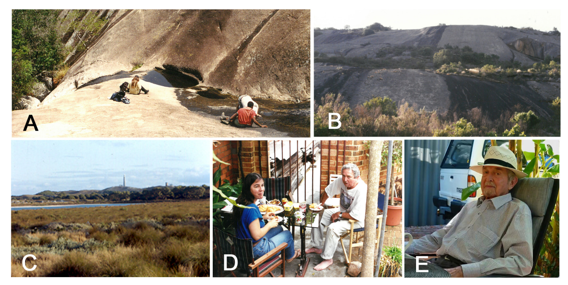
Figure 2. Don (part obscured) showing Afrochlus to the local guide, at type locality, Ngoma Kurira, Zimbabwe; B. Yorkrakine Rock, Western Australia showing dark staining of past (and future) water flow where Austrochlus develops; C. Bagdad Lake, Rottnest Island, Western Australia; D. Don and Penny Gullan, at breakfast, Lake Street, Northbridge, Perth, 1998; E. Don Edward at ease, 2016.

Fortunately, England had a one-day game of cricket against Zimbabwe, so Don and I learnt much about Zimbabwe cricket and politics and English cricket frailty as we joined spectators tending their braais (barbecues) in the stands, of course with more beer. Encounters with heavily armed police and army and long queues for food, and black market currency exchanges were offered: Don remained unflappably avuncular throughout.