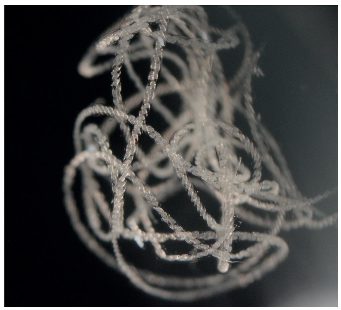
Figure 3. A string of Trichochilus lacteipennis eggs suspended in water near the bottom of a glass rearing vessel.

We visited the Lake Umbagog site again from 18-24 June, 2017, with the intent to collect more Trichochilus eggs and adults, and to look for their immatures in Elliptio complanata , which we knew to be abundant in the lake. Weather during all 5 mornings of our 2017 stay was windy and/or rainy during the 0700-0900 window within which we had observed oviposition flights in previous years. Probably for this reason, only a few ovipositing Trichochilus were seen, and only one captured. The egg strings extruded by these females were much shorter than those observed in previous years. Long strings such as those in Figs 1-2 must surely present a great deal of wind resistance, thus requiring relatively still conditions for controlled flight. The single string collected in 2017 was placed in a 30 ml vessel similar to the ones used in 2016, but this time containing unfiltered water from Lake Umbagog. This vessel was stored in a cooler until 27 June when it was transferred to a 20° (15:9 photoperiod) water bath in the lab. By 30 June most eggs had hatched.