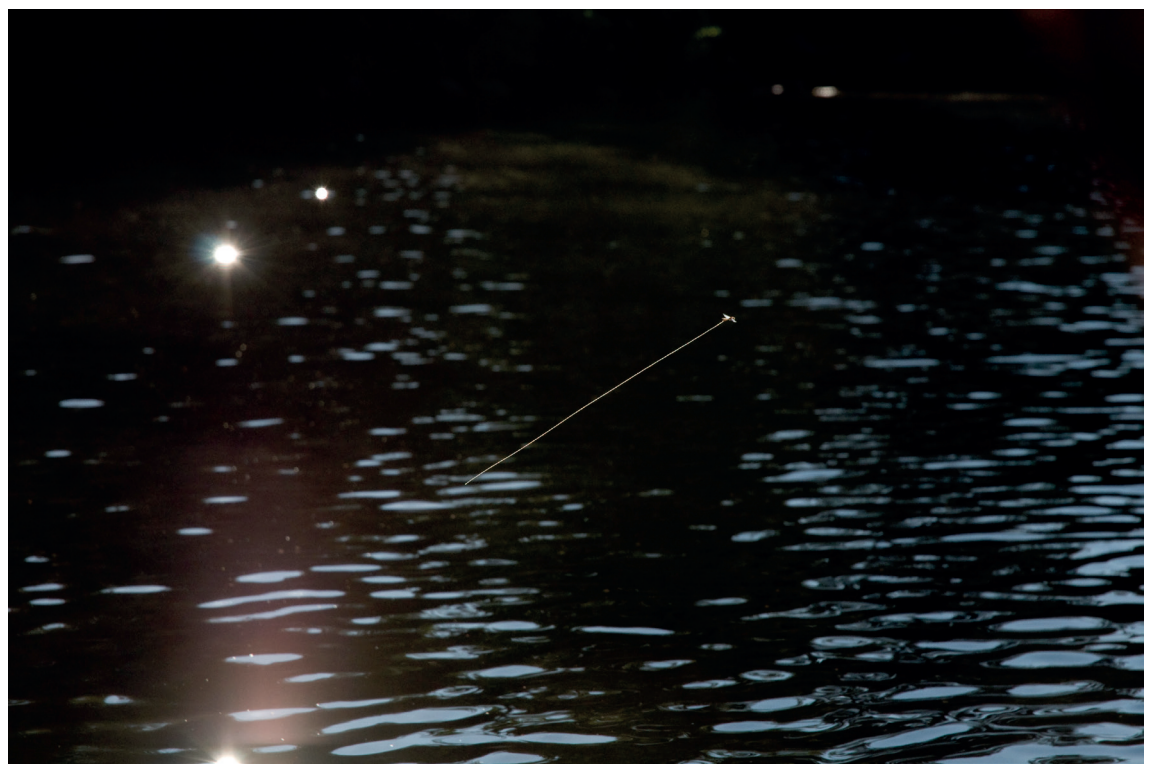
Figure 2. A female Trichochilus lacteipennis with egg string fully extruded, as it descended toward the water surface just prior to releasing the eggs.

Backlit by the low morning sun and observed against the dark, shady, mostly coniferous riparian forest, individual midges with their egg strings could be seen easily from distances up to 170 m. Three ovipositing females were collected and preserved in ethanol. All three were subsequently sequenced for COI (two by BOLD and one at the Stroud Water Research Center; see Appendix). Two individuals had identical haplotypes and the third differed by about 5%, suggesting the possibility of more than one species. No close matches to either haplotype were found in existing databases.