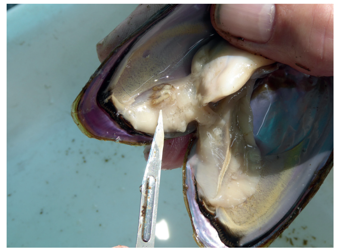
Figure 4. Four Trichochilus lacteipennis pupae revealed by incision of the outer lamella (marsupium) of the right gill of an Elliptio complanata .

In addition to Baeoctenus bicolor , Gordon et al. (1978) found a total of 860 larvae of another, unknown orthoclad ("near Phycoidella ") in Pyganodon cataracta (but not in three other unionids examined, including Elliptio complanata ). These larvae were collected by severing the mussels' adductor muscles and washing the tissues with a jet of water over a dish. Only first instars were found and these had a similar seasonal pattern of occurence as Baeoctenus , "with a substantial decrease in June, followed by a sharp rise throughout July and early August." The apparent absence of any later instars or evidence of feeding damage led the authors to postulate that the association was not parasitic and that the larvae left the mussels to pass the remaining instars elsewhere. Roback (1979) provided figures and a description of these first instar larvae (as "Genus near Phycoidella " sensu Sæther) based on the collections by Gordon et al. (1978) as well as on material from five genera of unionids collected in Louisiana. Epler (2001) considered these to be Trichochi lus despite some differences between Roback's (1979) description and the fourth instar Trichochilus larvae from Pennsylvania, e.g. the presence of a "comb-like row of preapical setae" on the mandible in Roback's first instars, which Epler suggested might disappear in later instars. Our Trichochilus hatchlings are similar