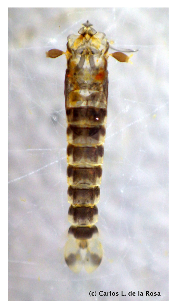
Figure 3. Pupal exuviae of undescribed Apsectrotany- pus .

New technologies, such as DNA barcoding applied to pupal exuviae and chironomids in general (see Ekrem and Stur, 2007; Ekrem et al., 2010; Stur and Ekrem, 2011; Anderson et al, 2013; and Kranzfelder et al., 2015, as examples) also promise to increase exponentially the number of correctly associated material without having to rear them from larvae, as well as open a huge opportunity to correctly identify species using DNA from pupal exuviae (Krosch and Cranston, 2012). Additionally, the use of chironomid pupal exuviae sampling in tropical environments has received a strong boost from recently published papers (Kranzfelder et al., 2015b; Kranzfelder and Ferrington, 2015; and the very interesting Kranzfelder et. al., 2015a which uses video to present their techniques). These and other papers forthcoming in Spanish will facilitate access to proper techniques, protocols, applications and, eventually, keys to the many genera and species that live in this huge bioregion to an underrepresented but eager audience of Latin American scientists and students.