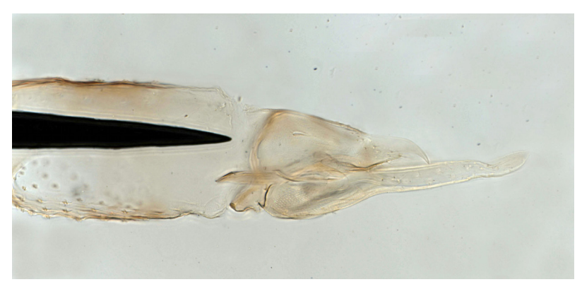
Figure 2. Enlarged view of object in Fig. 1. Image software-integrated from three exposures, then edited for clarity (see text).

Figure 1 was photographed under a stereoscope (Leica M205 C). Figure 2 is a software composite (using Helicon Focus, version 5.3) of three exposures made under a compound microscope (Zeiss Axioskop 2 plus) in phase-contrast mode. During figure editing (Adobe Photoshop CS4), some specks were removed and background areas smoothened.