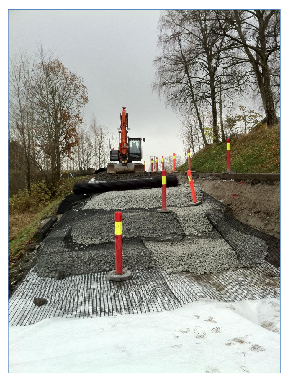
Figure 10: Picture from Fv115 south for Mønster bridge (Østfold, Norway) during constructuin phase. Observe the three layers with foamglass which is separated by reinforcing mesh<sup>[9]</sup>.