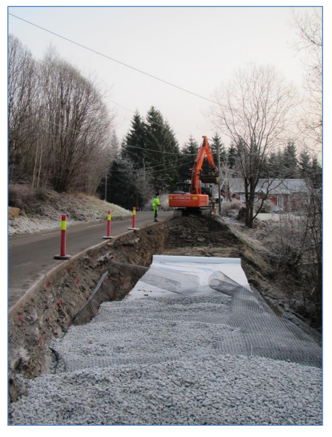
Figure 4: Foamglass is delivered. levert. Notice the geotextiles at the lower background in the picture. This slope is located on highway 120 north of Tomter, Østfold<sup>[14]</sup>.

Geotextiles is added at the top of the foamglass, and is then covered with a 30 cm thick layer of crushed rock, as part of the upper superstructure. The geotextiles prevents the stone materials from mixing with foamglass. Before the layer of crushed rock is added, erosion net is added 1 m within the slope edge. The weight of the superstructure anchors the erosion net well. The erosion net is added above the geotextiles.