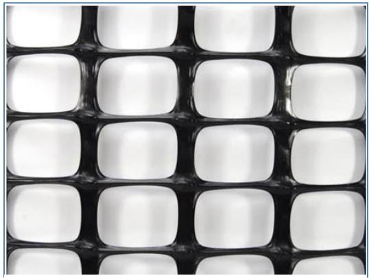
Figure 6: Armeringsnett av typen Tenax Geogrid LBO 330 [16].