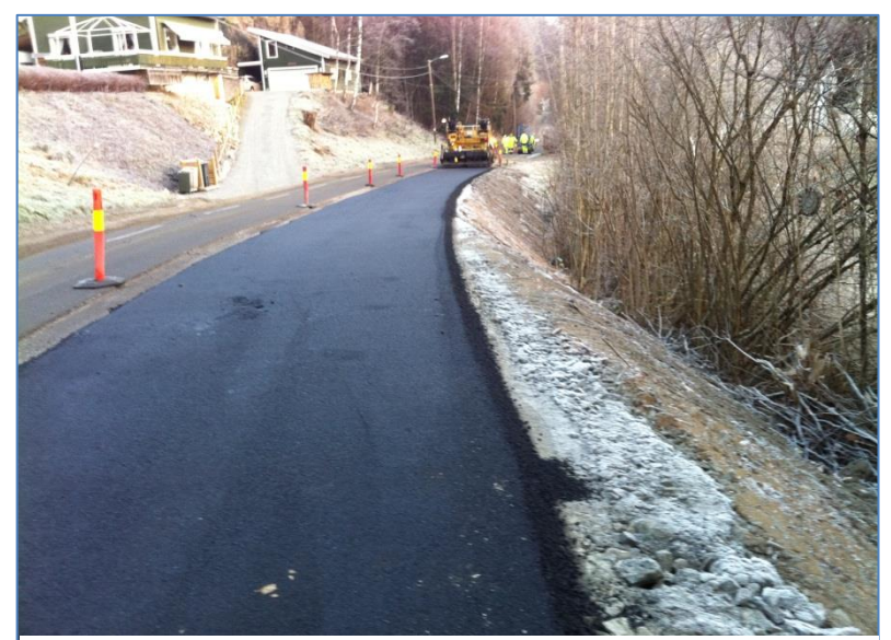
Figure 7: New layer of asphalt. Notice the cogging that is cutted into the untouched part of the road <sup>[9]</sup>.

Spray seed leads to faster growth, promotes desired vegetation, and reduces the growth of weeds.At the same time it prevents erosion and run-off. Spray seed is an especially fast and efficient way to sow large areas. One spray seed truck can cover up to 7000 m2 and have a spray range of 30-40 m.