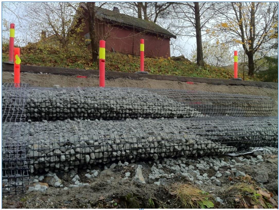
Figure 11: Mesh reinforcement around the foamglass<sup>[9]</sup>.