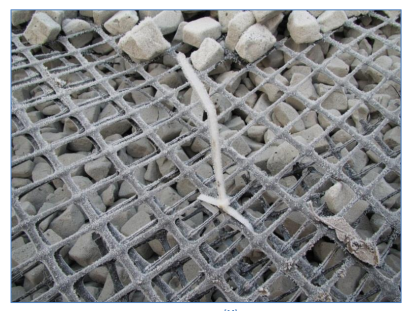
Figure 8: Geotextiles are joined with strips <sup>[14]</sup>.