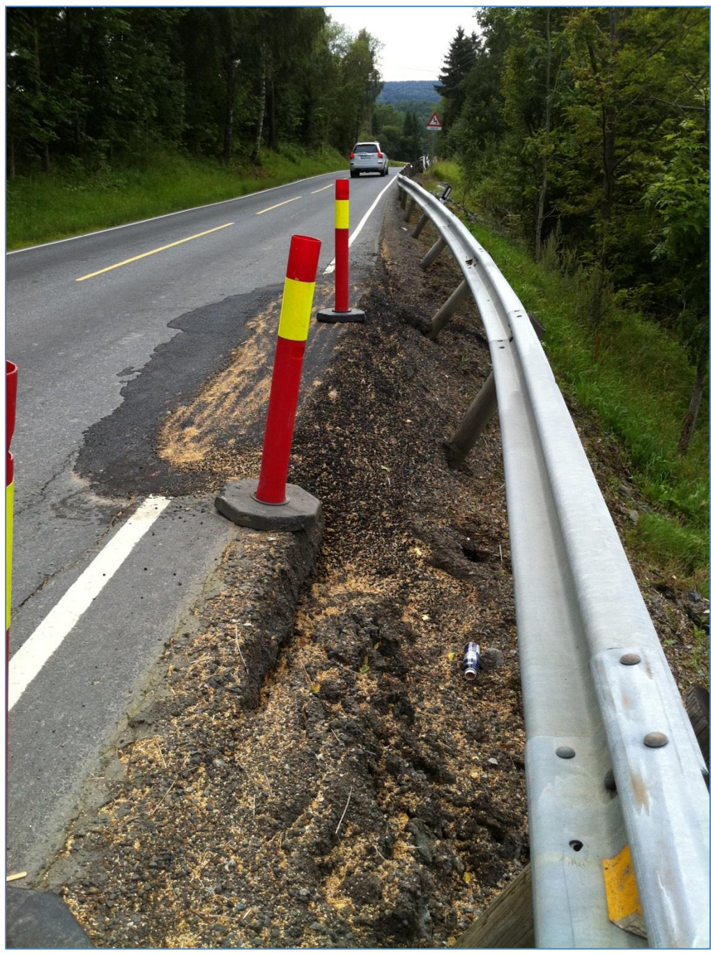
Figure 9: Picture from Fv 115 south for Mønster bridge before the repairation were started in fall 2011<sup>[9]</sup>.