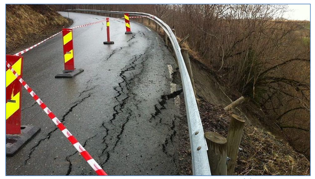
Figure 1: This picture is from Fv 734 (Varmbuvegen) in Melhus in Sør-Trøndelag<sup>[13]</sup>. It is a typical example of problems with instability in steep slopes and where it is large expectations regarding the method described in this paper. In Norway there is a large number of steep slopes with similar problems.