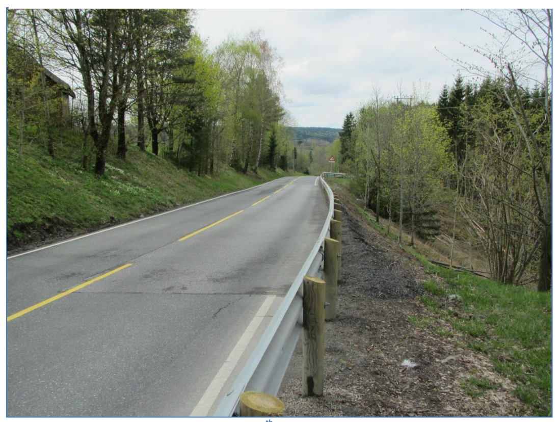
Figure 12: Same place as figure 2. Picture is taken 9<sup>th</sup> may 2012 when the projectgroup was on inspection. 6 months after the first inspection there is no signs of deformation or settlements of the area that was repaired in fall 2011<sup>[14]</sup>.