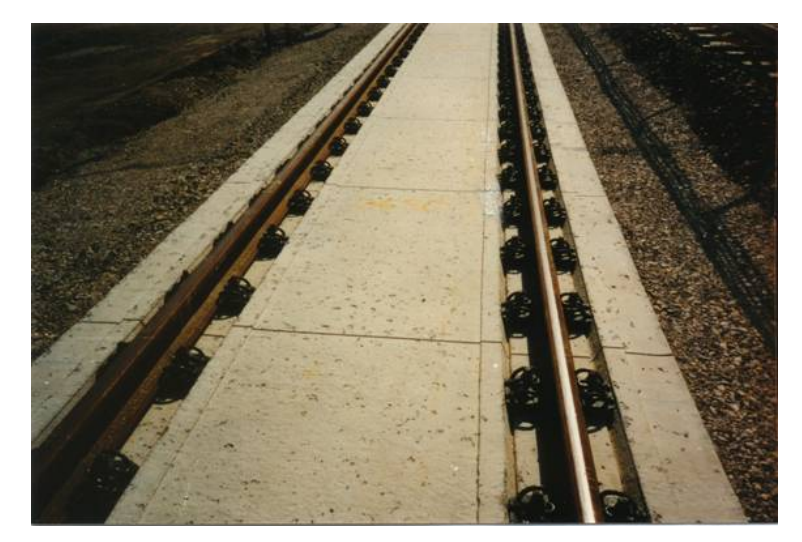
Figure 5: Ballastless track with discrete rail seats on a continuously reinforced concrete pavement (CRCP) with dummy joints to control transversal cracking.

For ballastless track design/modelling following parameters are typical (mixed traffic, axle load up to 250kN):