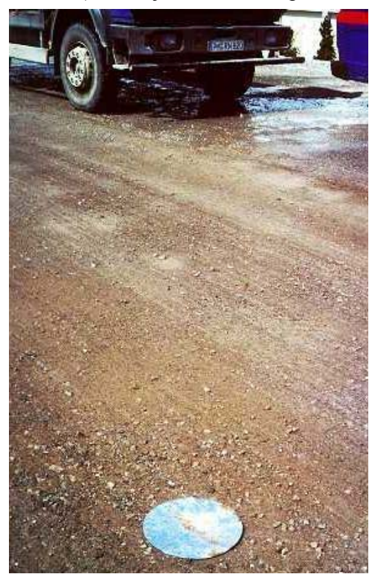
Figure 3: Unbound base layer with high bearing capacity but low permeability.

Sufficient Drainage, permeability etc. are very important topics esp. for unbound layers. But in general stiffer structures made by unbound materials as wells as CTBs show lower permeability. Therefore bearing capacity requirements of base layers should be on a moderate level. E.g. the discussed increase of deformation modulus Ev_2 up to 180 MPa (instead of 150MPa) was rejected to avoid permeability problems (see figure 3).