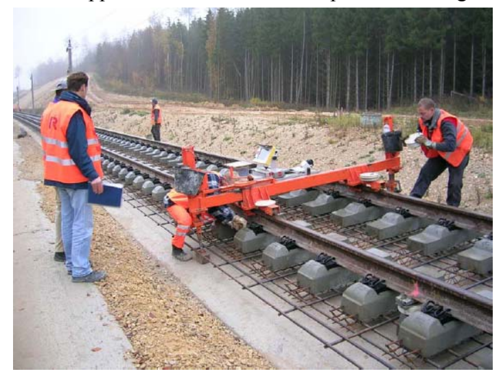
Figure 4: Track adjustment preparing for continuously reinforced concrete pavement (CRCP) on a cement treated base layer (CTB).

To reflect the behaviour of continuously welded rail (CWR) also continuously reinforced concrete pavements (CRCP) with free or controlled transversal cracking (JRCP) were used. Typical longitudinal reinforcement (diameter 20mm) placed at the neutral axis of the slab is 0,8% to 0,9% of the total cross section (0,4% to 0,5% for jointed JRCP). This amount of reinforcement is sufficient for vertical load transfer at the crack or dummy joint and limits crack width. The design of slab thickness is based on the tensile bending stress capacity of the concrete as applied for road and airfield pavement design.