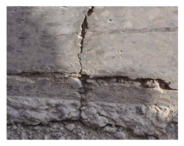
Figure 2: Eroded surface of CTB beside joint of the concrete pavement (longitudinal section)

Figure 1: Excerpt of German RStO 12 (FGSV, 2012). Deformation modulus Ev<sub>2</sub> [MPa] and thickness [cm].