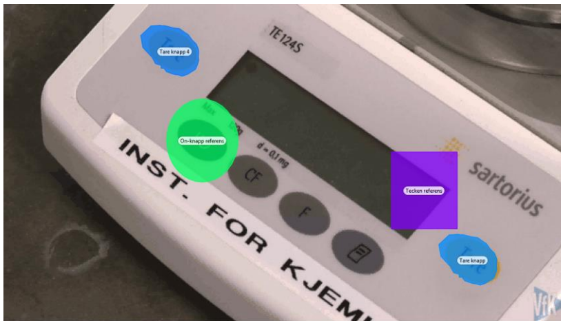
Figure 3 Areas of interest defined as attractors during a narration where instructions on how to operate the balance are given.