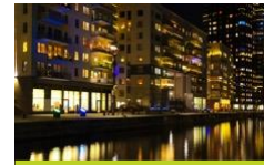
Team Built Environment