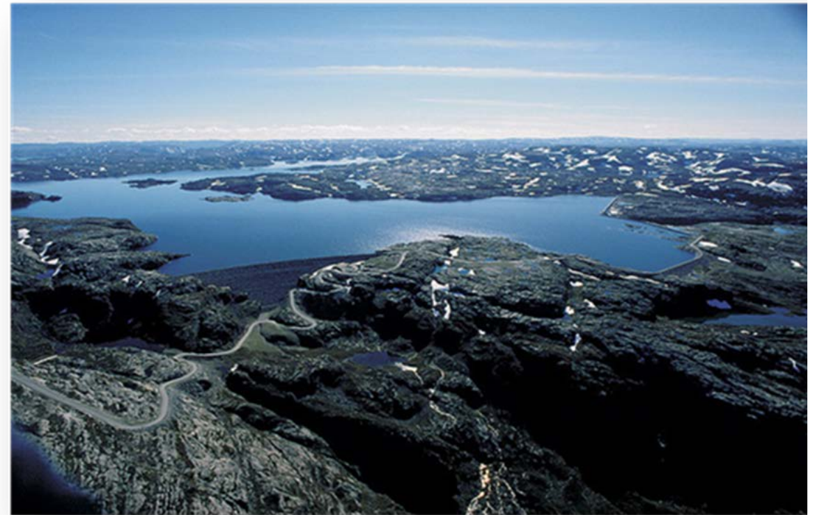
Blåsjø magasin.

How will a circular economy impact on hydropower.