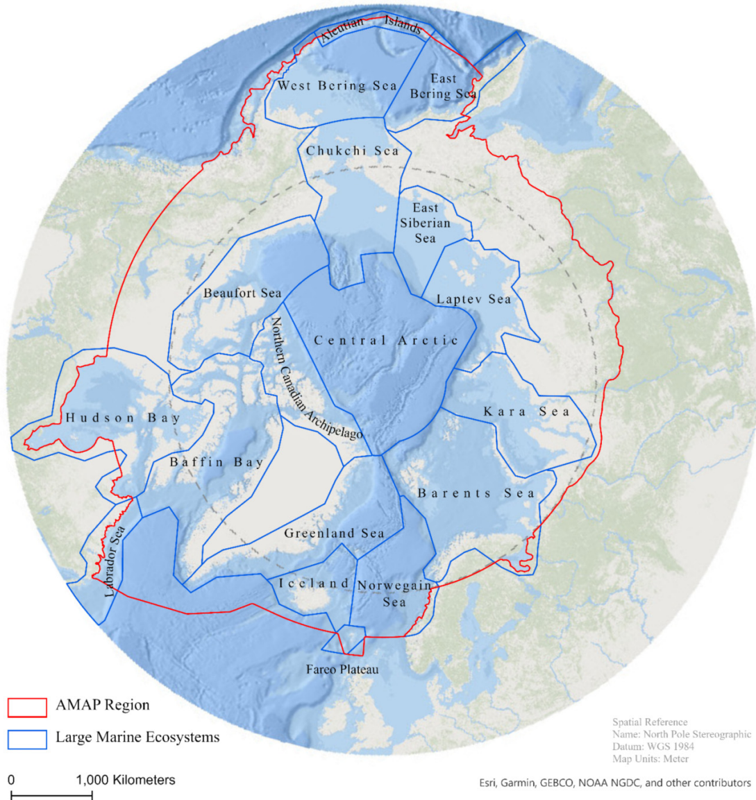
Fig. 1. The Arctic Monitoring and Assessment Programme (AMAP) region and the 18 large marine ecosystems (LMEs) it includes. AMAP comprises eight member states: Canada, Denmark, Greenland, Faroe Islands, Finland, Iceland, Norway, Russian Federation, Sweden, and United States; and six permanent participants: Arctic Athabaskan Council, Aleut International Association, Gwich'in Council International, Inuit Circumpolar Council, Russian Arctic Indigenous Peoples of the North, and Saami Council. Map constructed in ArcGIS Pro with Shapefiles from AMAP (Steenhuisen and Wilson 2013) and PAME (Protection of the Arctic Marine Environment Working Group (PAME) 2013a, 2013b). Map Projection: WGS 1984 Web Mercator (auxiliary sphere). Coordinate system: WGS 1984.

marine snow (e.g., Long et al. 2017; Porter et al. 2018) or ice algae. Given the susceptibility for sediment in calm areas to accumulate and sequester microplastics, and the potentially weak upward transport of already buried plastics ( \geq 100 \mu\text{m} ) (Brandon et al. 2019; Fan et al. 2019; Näkki et al. 2019; Courteney-Jones et al. 2020), these depositional systems represent a temporal record of plastic input to aquatic environments (e.g., Dahl et al. 2021). However, microplastics settled on the seafloor or stranded on shorelines may still be subsequently resuspended and further transported with water currents or redistributed within the sediment column (Enders et al. 2019; Kane et al. 2020; Martin et al. 2022).