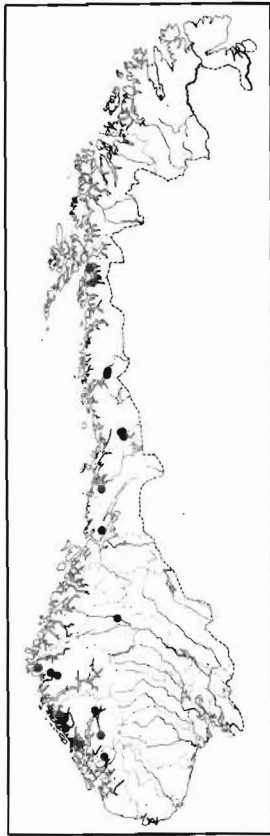
Fig. 5. The known distribution of Lecanora ochrococca in Scandinavia.

ed under the name Psora cladonioides (Fr.) Th. Fr. is Lecanora ochrococca .