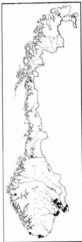
Fig. 8. Parmelia acetabulum in Norway (Krog et al. 1980, updated).

New to Sogn og Fjordane and central Norway.