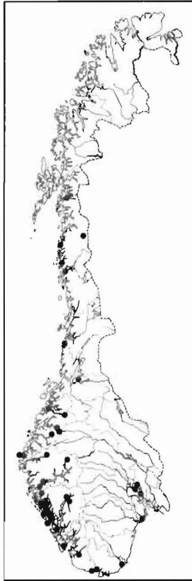
Fig. 6. The known distribution of Opegrapha zonata in Norway.

Sør-Trøndelag: Trondheim , between Tomset and Tømmerholt, alt. 200 m, NR 7329 (1621 IV), 1983, T. Tønsberg 8130.