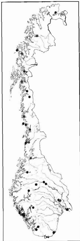
Fig. 7. The known distribution of Opegrapha gyrocarpa in Norway.

New to Møre og Romsdal, central and northern Norway.