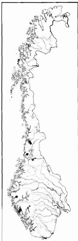
Fig. 4. The known distribution of Cladonia alpina in Europe.

Dirina massiliensis Durieu & Mont. f. sorediata (Müll. Arg.) Tehler