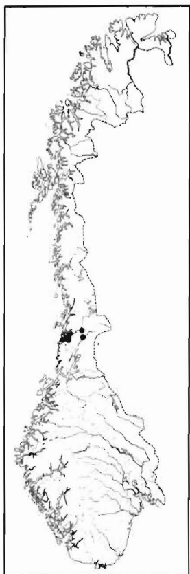
Fig. 1. The known distribution of Arthothelium norvegicum .

Arthothelium norvegicum Coppins & Tønsb.